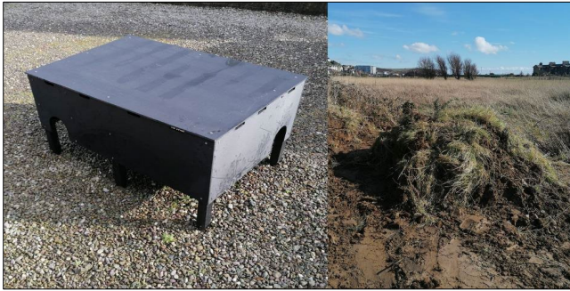
An example of a recycled-plastic artificial otter holt constructed and installed by Triturus Environmental Limited.

Otter holts are protected structures under the EU Habitats Directive and as such consultation is to take place between the landowner (Dublin City Council) and National Parks and Wildlife Service, with a view to installing a holt. If permission is granted, we may look at installation in 2023.