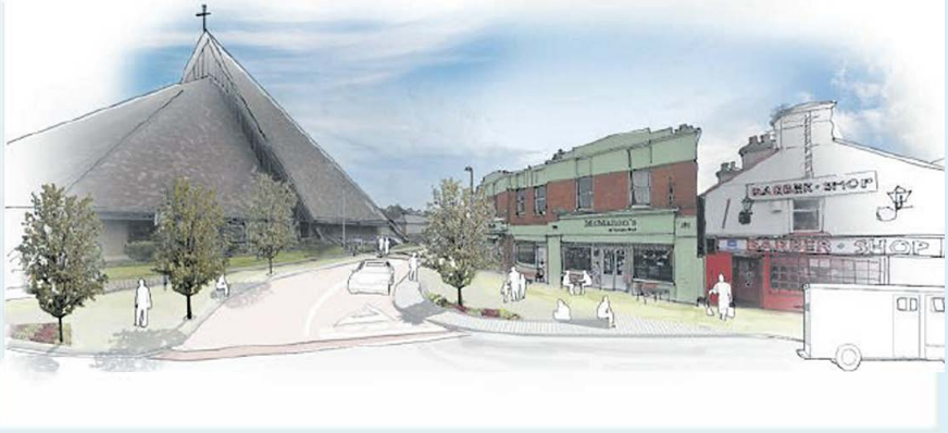
Glasnevin Village Urban Realm Improvement